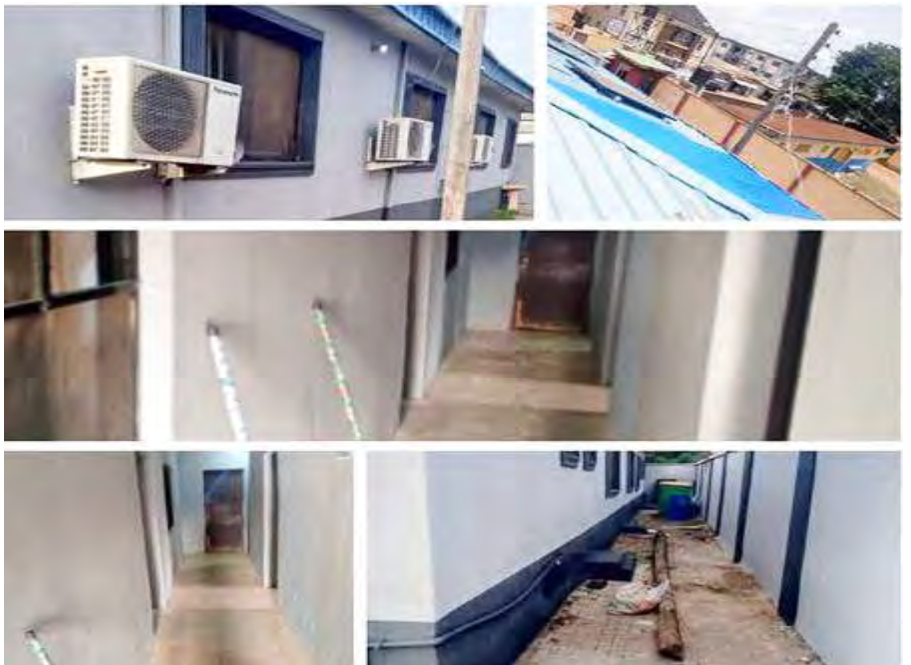
The renovated Ajeabo Primary Health Centre

system, full air conditioning for patient comfort, a consistent supply of essential drugs, and round-the-clock availability of doctors and nurses. Furthermore, the facility now operates with 24-hour medical staffing, ensuring continuous access to doctors and nurses. This upgrade reflects the Chairman's dedication to enhancing healthcare services within the community. This upgrade underscores the Chairman's focus on providing quality healthcare to the community.